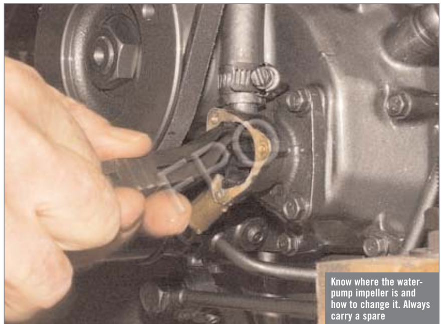
Know where the water-pump impeller is and how to change it. Always carry a spare